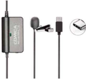
SIG.LAV V05 UC