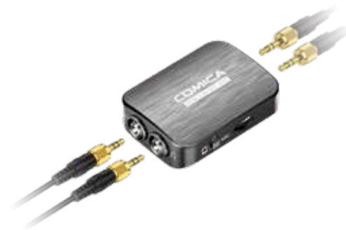
DUAL.LAV D03 SUC